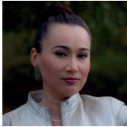
Olga Chernishiva, Soprano